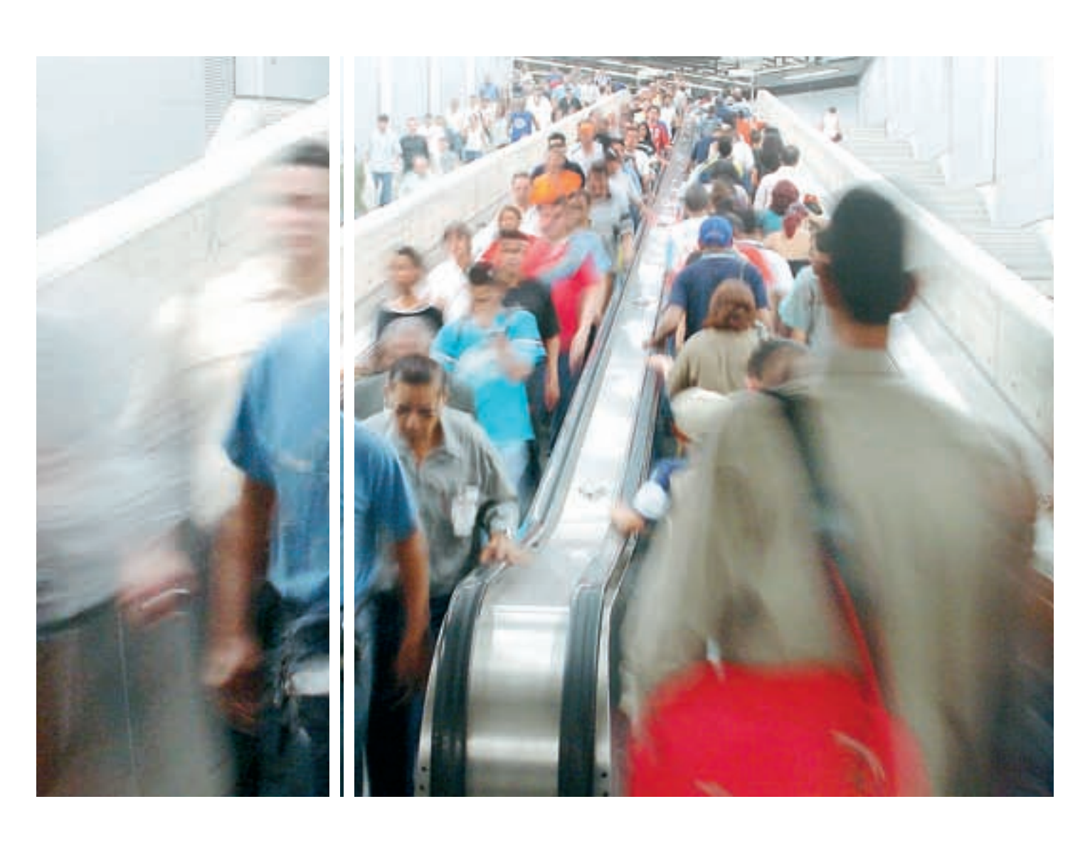
Application Guide for Public Transportation When Moving Masses Means Individual Comfort.